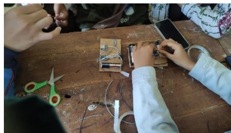
Figure 2. Creating Solar Powerbank Products

The next stage, namely Application at this stage the teacher guides students to start designing solar-powered power banks. Learners make solar-powered powerbank products with their groups and write down the work steps for making products. At the stage of making solar-powered power banks which are carried out in groups, the teacher monitors the activeness of students during project work and monitors students if they experience difficulties. Each learner must be involved and contribute during the manufacturing process. So that students are able to complete the project as planned. Making solar-powered power banks is an application of the prototype stage design thinking strategy, which is characterized by students expressing their ideas in the form of real work, namely making solar-powered power banks as an alternative solution to reduce electricity use (Figure 2). At this stage, students can also produce answers that are presented in their own language which trains their creative thinking skills on their originality indicators. In accordance with the opinion of [17] that originality is the skill of students in solving problems in their own way.